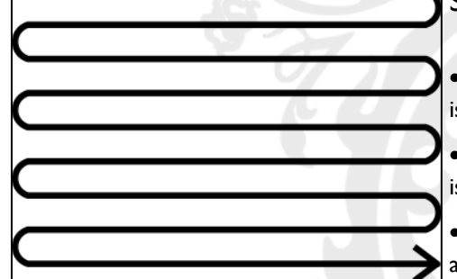
The ideal motion for spraying Instacoll Base is a single smooth line that doesn't cross over itself

Make sure that the object stands free and is approachable from all sides. You should be able to walk around, or turn, the object since you cannot stop moving while spraying.