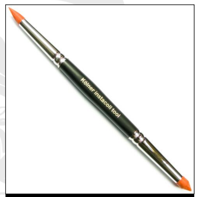
Pictured—Instacoll Tool. The soft rubber ends of the Tool are designed to press leaf into crevices of surfaces treated with Instacoll System.